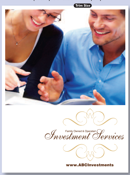
Note Document prepared WITHOUT BLEED All pages are 8.5" x 11" and do not get trimmed after printing. By staying within the SAFETY ZONE (with all Art, Photos, Backgrounds etc.) — you will achieve the above results.