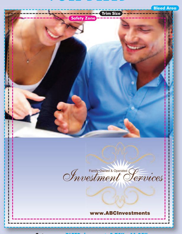
Set up your BLEED document: 8.75" x 11.25" This above is an 8.5" x 11" plus the addition of 1/8" on all 4 sides All Artwork must fill the Bleed area entirely