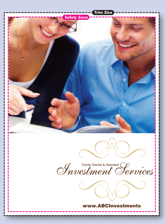
If you choose to print WITHOUT BLEED: All pages are 8.5" x 11" and All Artwork must remain within the Safety Zone and not extend beyond this area. (see Safety Zone measurements on flip side)