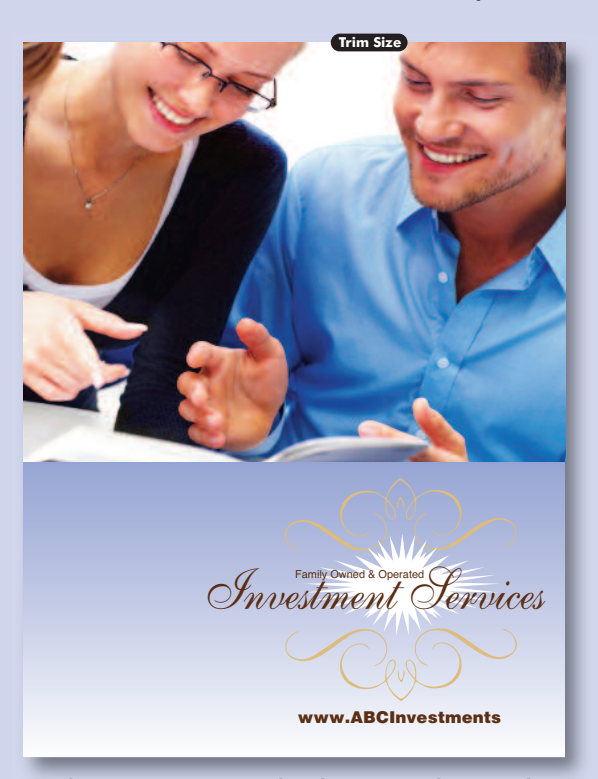
Short Run Printing prints the job on oversized paper and the BLEED area is trimmed off yielding a finished 8.5" x 11" document — printed from edge to edge!